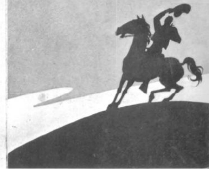
Vernon Caldwell's cover design for our second brochure, mailed in 1935. The development had not yet been named Rolling Hills.

1935 advertisement with logo designed by Disney animator Vernon Caldwell.