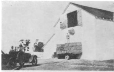
Loading hay for a dude rancher.