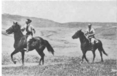
Her very own horse to feed.